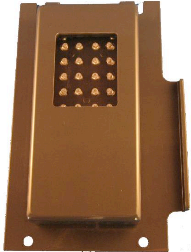
DPS 500 HVM